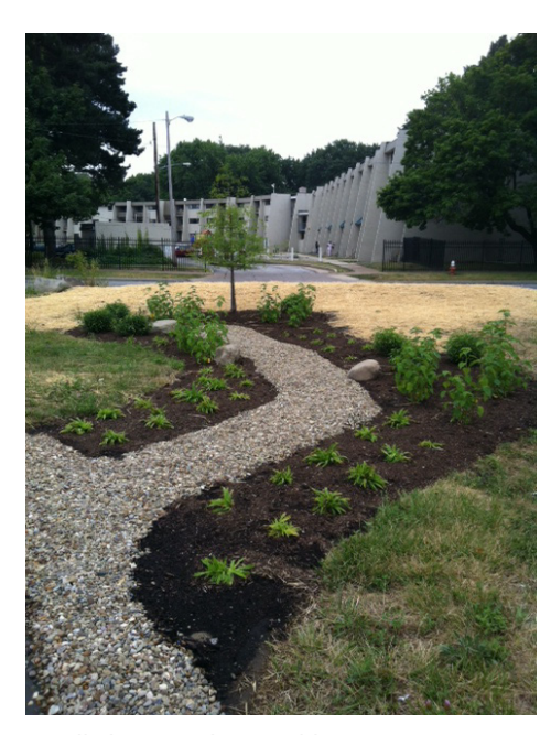
Installed rain garden at Ashbury Avenue provides improved stormwater management.

Equally important, is the legal, longterm maintenance and protection of the land. Enter the Western Reserve Land Conservancy, whose team created the first conservation